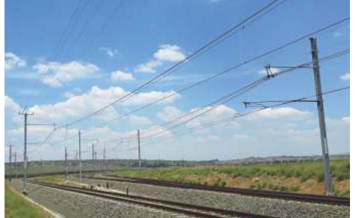
Railway Electrification Work, Majuba, South Africa

Concerted efforts are being made to secure contracts in Bangladesh, Thailand, Nepal, Turkey, Ghana, Sri Lanka, and Malaysia.