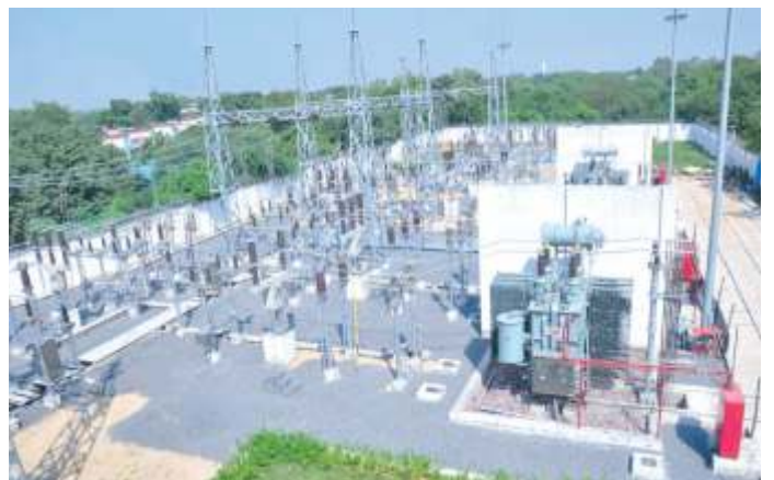
DMRC 66KV Sub Station at INA, Delhi