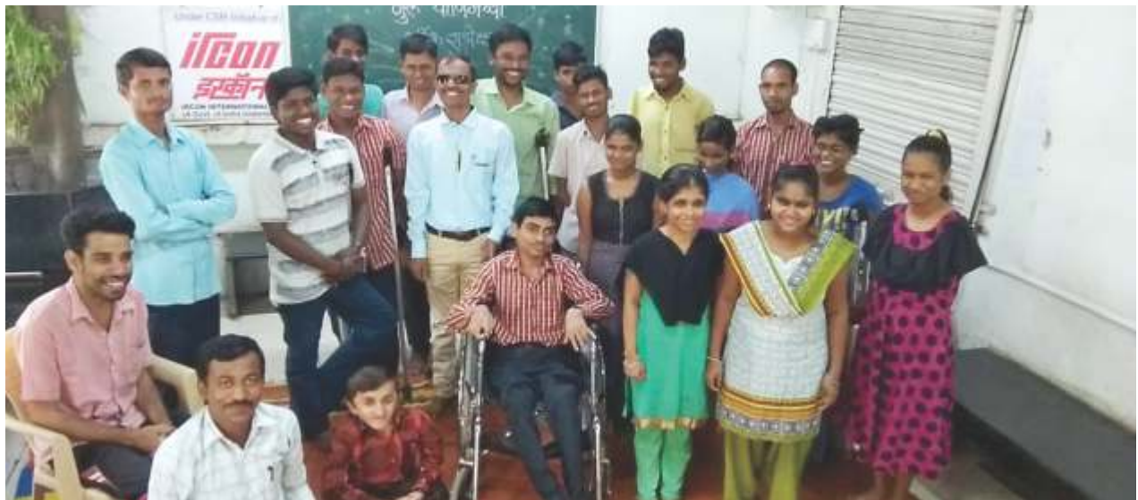
Residential Training Programme for specially abled students under CSR, Jalgaon, Maharashtra