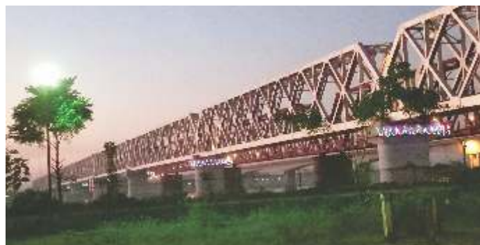
2 nd Bhairab Bridge on River Meghna, Bangladesh