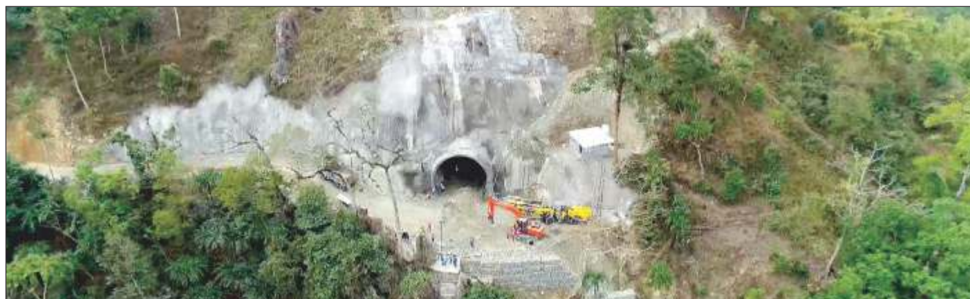
Tunnel work Sivok - Rangpo Project, Silliguri, West Bengal