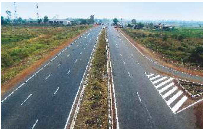
Shivpuri - Guna 4 Lane Highway Project