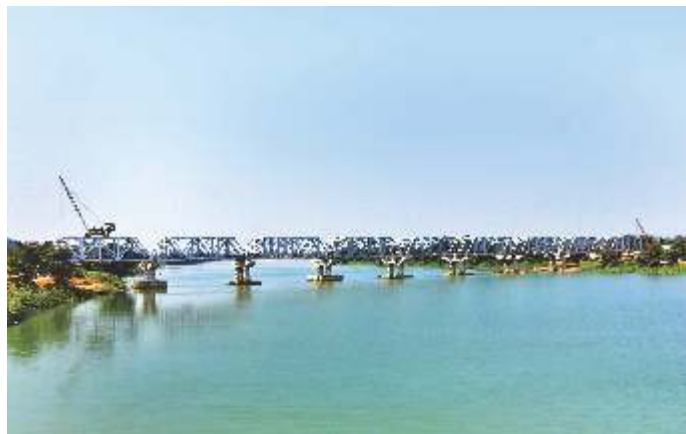
Railway bridge No. 17, Chhatisgarh