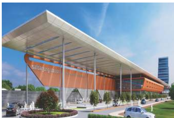
Proposed Safdarjung Station, New Delhi