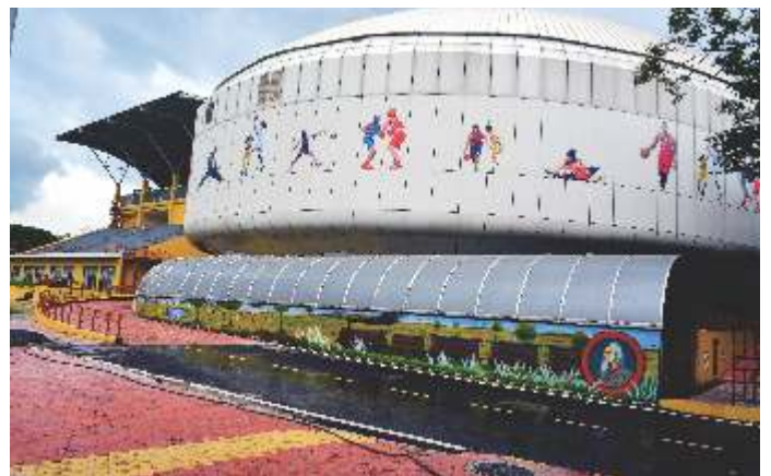
Indoor Sports Complex, Behala, Kolkata