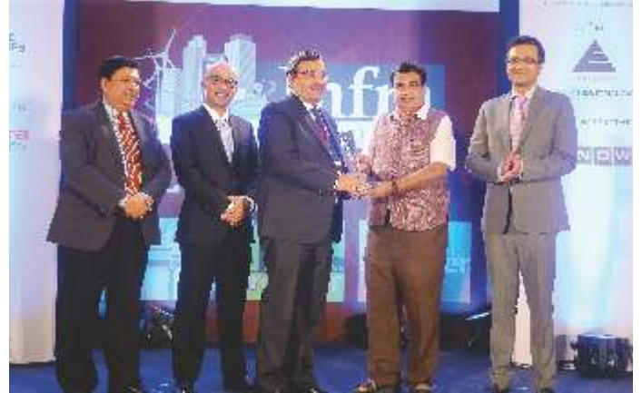
Dun & Bradstreet Infra Awards 2017