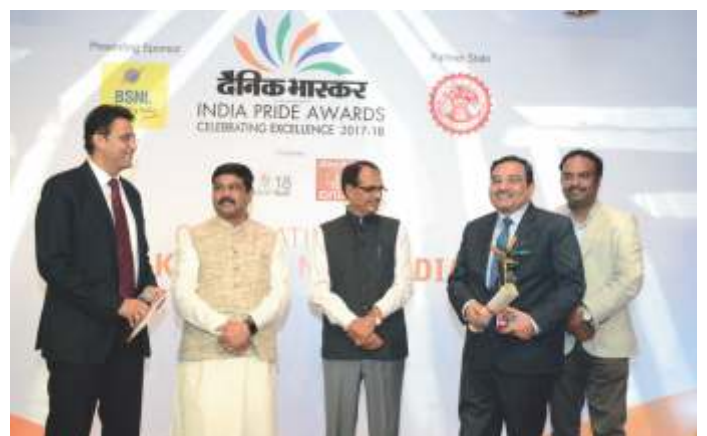
Dainik Bhaskar India Pride Awards 2017-18