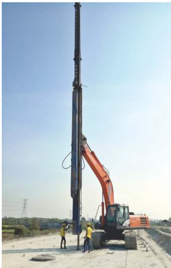
Installation of Prefabricated Vertical Drains, Bangladesh

The project is progressing slowly due to late handing over of encumbrance free land and issuance of drawings for alignment (L-section and X-section), bridges and buildings by the Engineer/Bangladesh Railway.