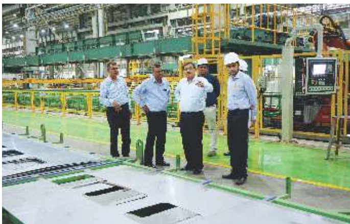
Inspection by CMD at Modern Coach Factory, Raebareli