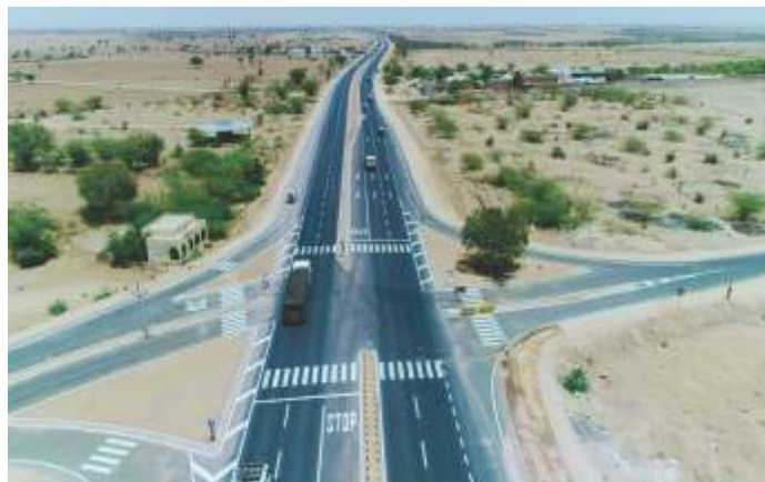
Bikaner-Phaludi Highway Project