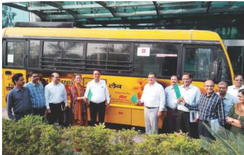
Mobile Computer Lab for Computer literacy in Korba Chhattisgarh, under CSR