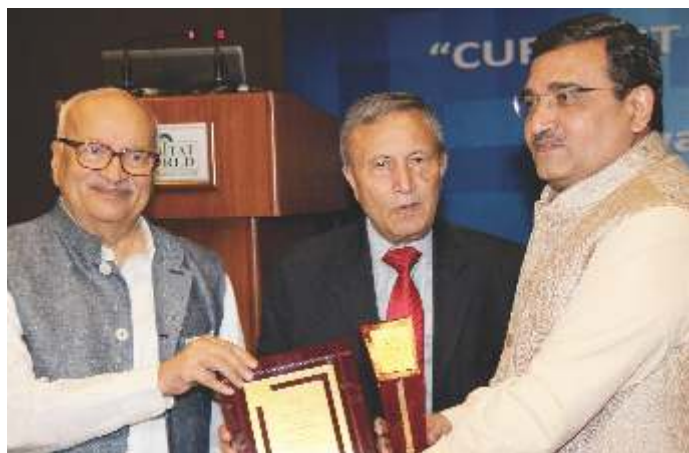
Excellence Award & Udyog Ratan Award